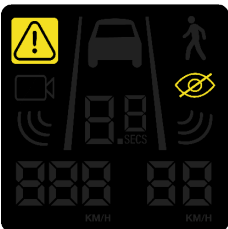
Suspected Smoking Device