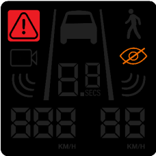
Inattention Severity 2