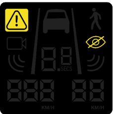
Drowsiness Severity 1