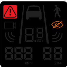
Drowsiness Severity 2

Audible alert: Short sharp tone, 3 seconds