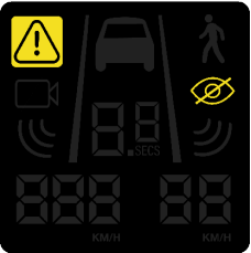
Inattention Severity 1

Your vehicle may be equipped with an optional in-cab sensor camera system designed to intelligently detect risks incurred by sleep, drowsiness, inattention, and smoking. Your fleet may choose to detect some or all of these risks. The system alerts drivers with sounds from a built-in loudspeaker when a risk is detected.